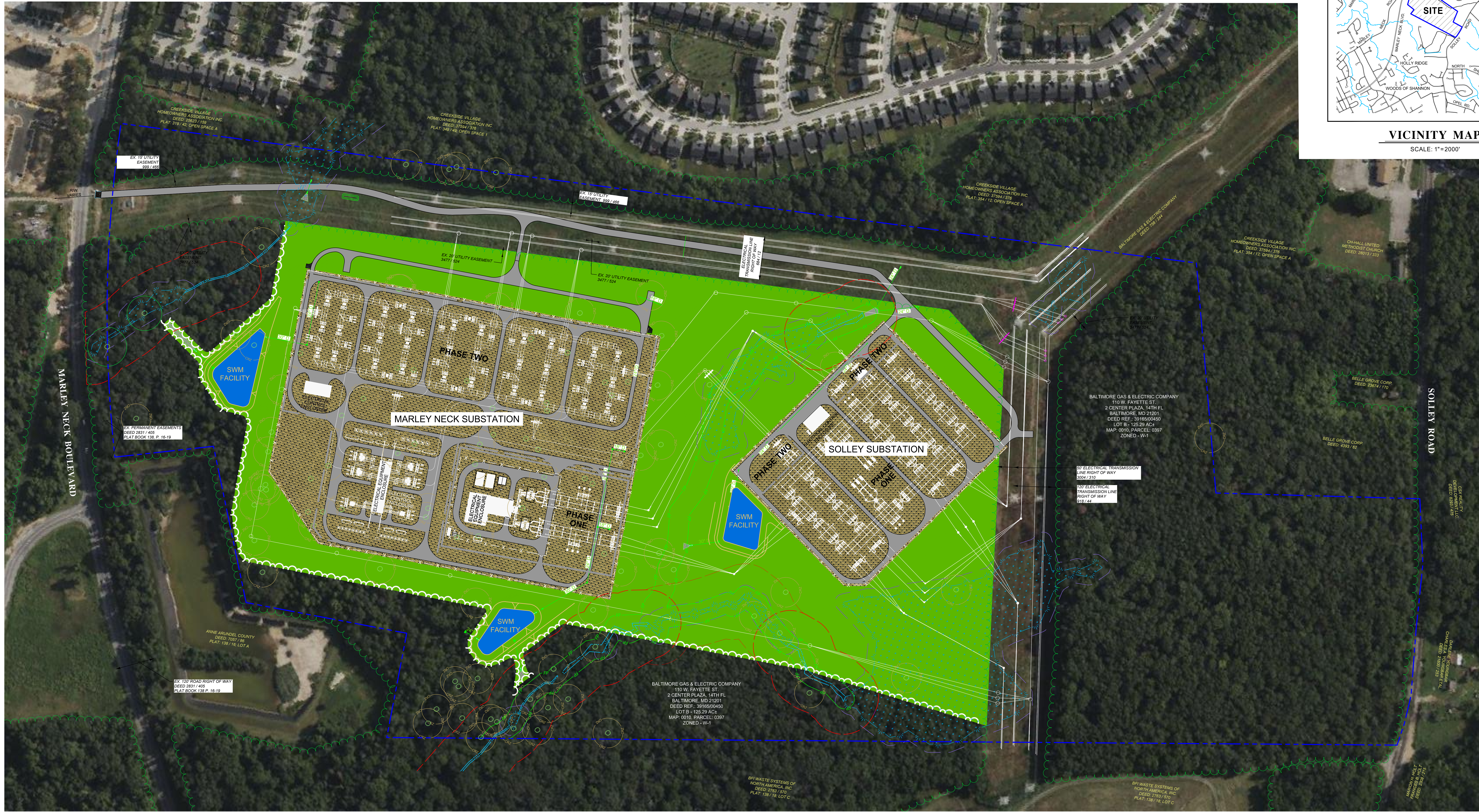
PLAN SCALE: 1"=100'